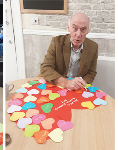
Making our 'Heart of kindness' for World Kindness Day