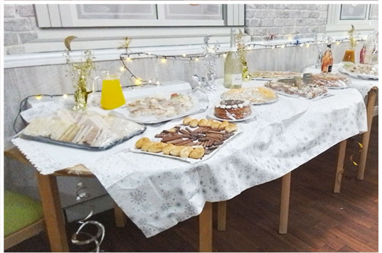
Disco party fun!