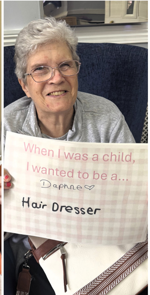
Residents at The Old Downs Care Home revealed what they wanted to be when they were children – a singer, a swimmer and a hairdresser.